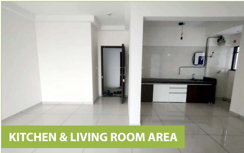
KITCHEN & LIVING ROOM AREA