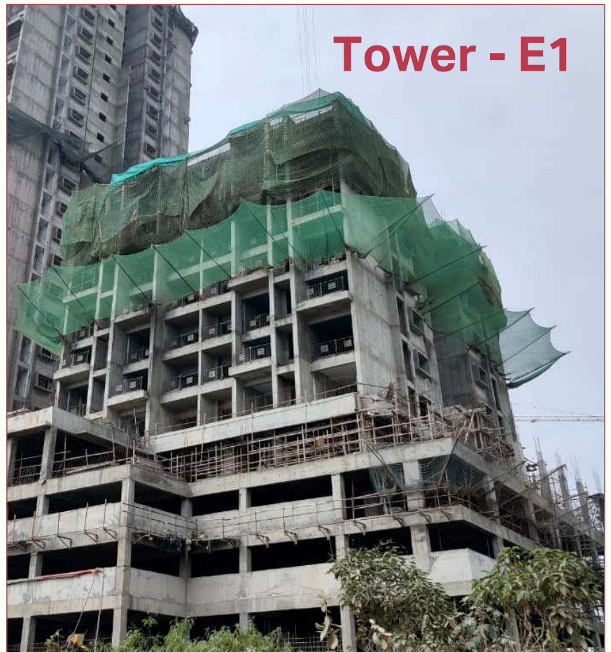
Tower - E1